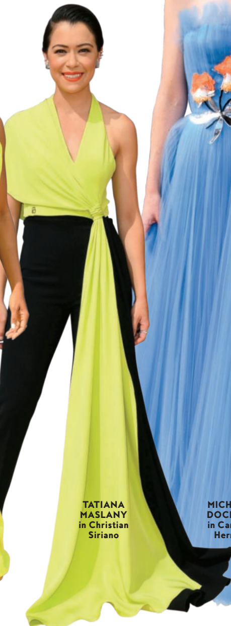
TATIANA MASLANY in Christian Siriano