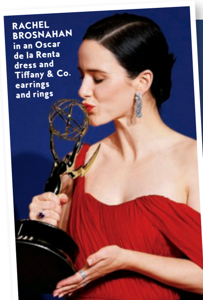
RACHEL BROSNAHAN in an Oscar de la Renta dress and Tiffany & Co. earrings and rings