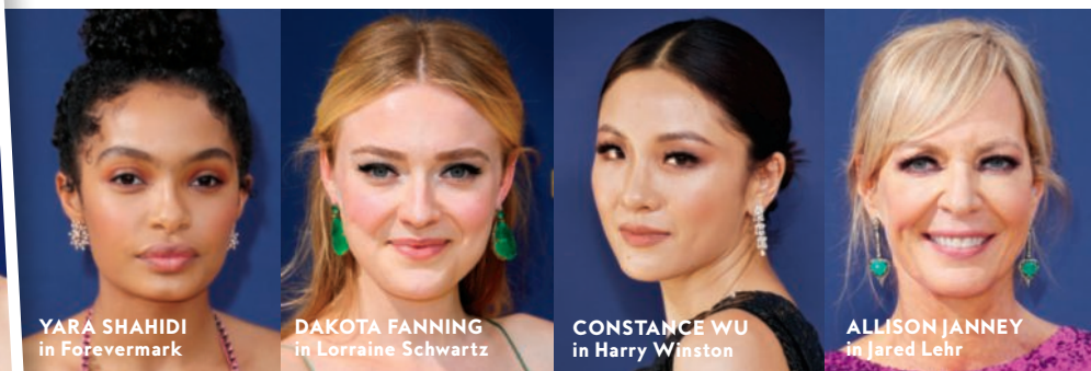
YARA SHAHIDI in Forevermark