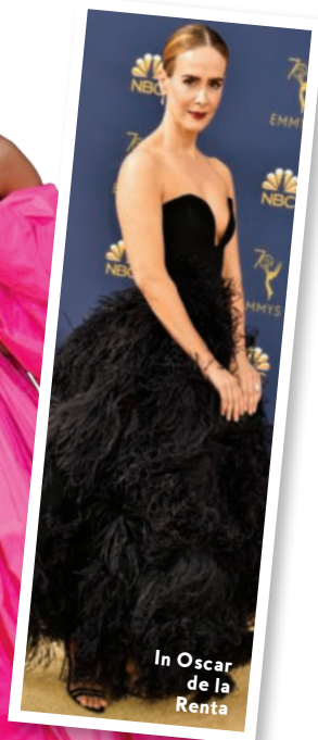
In Oscar de la Renta