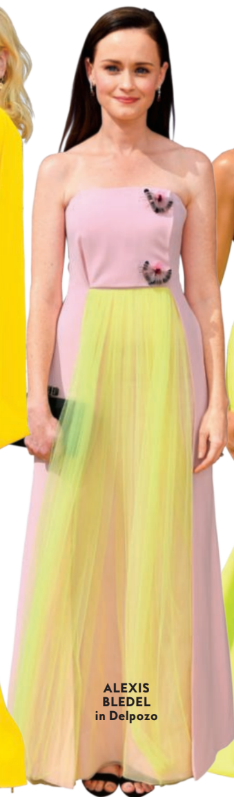
ALEXIS BLEDEL in Delpozo