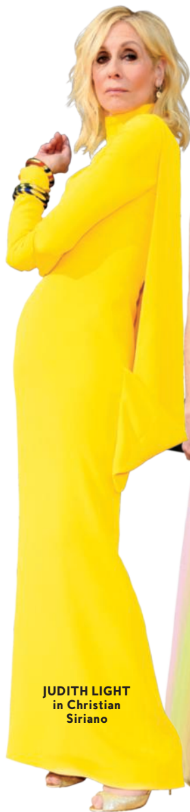
JUDITH LIGHT in Christian Siriano

How do you pull off this season's highlighter hues? Keep the silhouette streamlined, and add a sweeping skirt or sash for good measure.