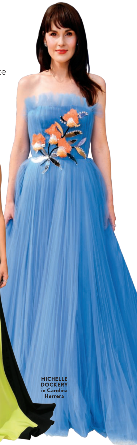
MICHELLE DOCKERY in Carolina Herrera