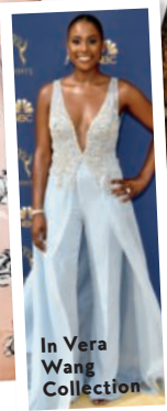
In Vera Wang Collection