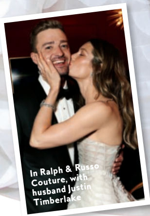
In Ralph & Russo Couture, with husband Justin Timberlake