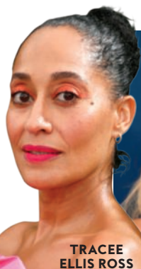
TRACEE ELLIS ROSS

Smoky eyes took a back seat to the red-orange eye-shadow trend, which ranged from bold apricot shades to more subtle swipes of crimson.