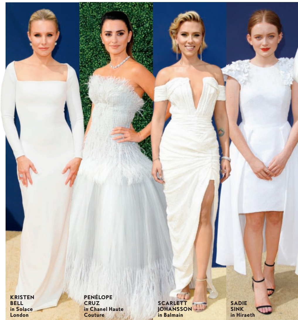
KRISTEN BELL in Solace London

Pared-down palettes with exquisite details and luxurious textures put these elegant actresses in the spotlight.