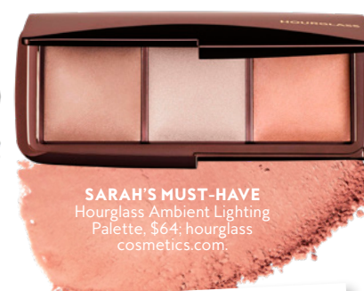
SARAH'S MUST-HAVE Hourglass Ambient Lighting Palette, $64; hourglasscosmetics.com.